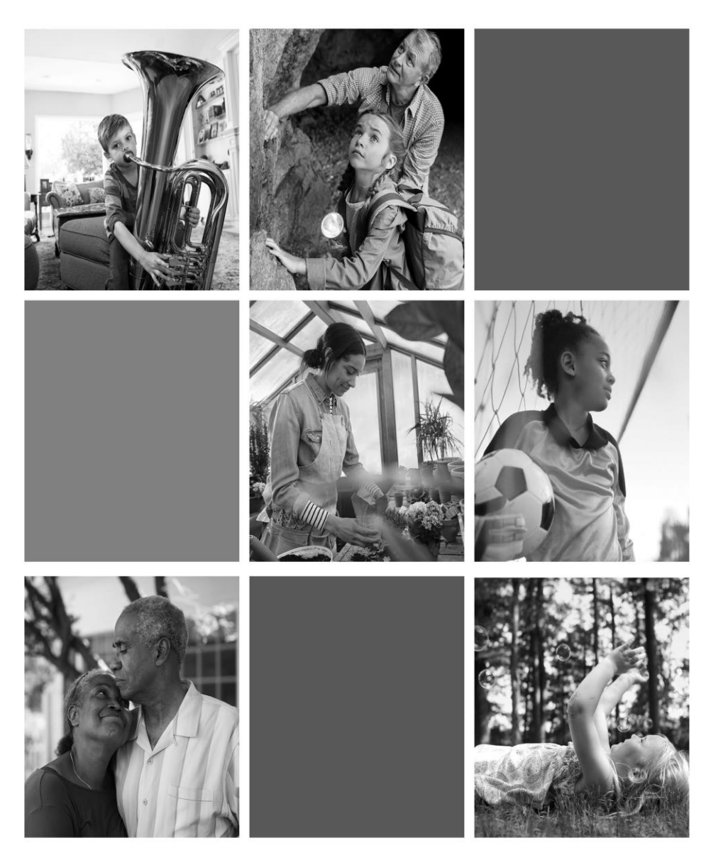
Your Health Care Benefits Program